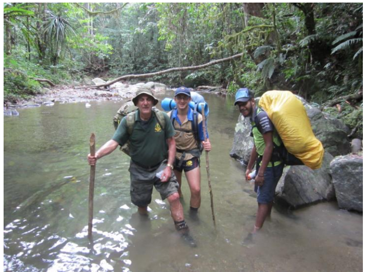
One of the many small creek crossings

Each year five thousand Australians take up the mentally and physically challenging task of walking the Kokoda track. I decided I had to walk this famous 96km long track. Because of the difficult mountainous jungle terrain, I was advised to best get fit if I wanted to complete the trek. My 4 month physical training plan included daily hour long walks, climbing then descending Mt Macedon, Mt Donna Buang and the “1000 steps” in Mt Dandenong. All of this was done in walking boots, not runners (an old infantry trick to get used to blisters). I was ready, or at least I thought I was.