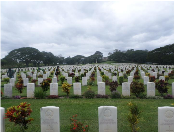
Bomana War Cemetery New Guinea. This is the largest war cemetery in the region with 3,779 graves of Australian and Allied servicemen, including 700 unidentified servicemen.