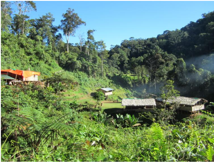
Above - One of the small villages on the way to Kokoda

After 12 long days I had completed my trek across the Kokoda track. I lost 4kg of weight during my pre trip fitness training and 6kg during the 12 day trek. On the plane trip home I thought to myself, how did they fight on that trail over 60 years ago? At parts, only wide enough for one man, each one carrying a rifle, ammunition, webbing, pack, food rations and water? I was very tired but my mind was buzzing. An experience I will never forget.